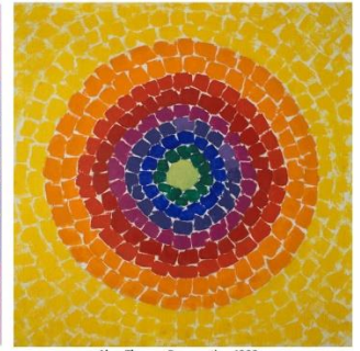
Alma Thomas, Resurrection, 1966